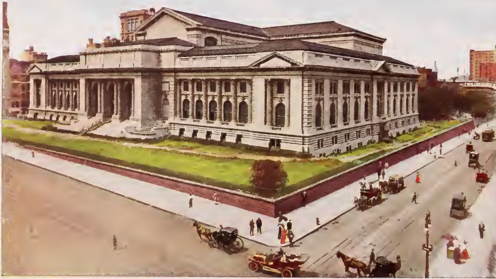
New York Library Bldg., 5th Ave. and 42nd St.

New York Library , of Astor, Lenox and Tilden foundations, is situated at 5th Avenue and 42d Street. It is built of white marble, and the interior is magnificent. It cost $5,000,000. The library occupies one of the finest sites in New York, and is one of New York's greatest attractions.