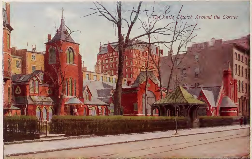
The Little Church Around the Corner

The Little Church Around The Corner , situated at 29th St. and 5th Ave., and founded in 1848. It is known as the most picturesque church in the City and a famous religious home for stage folk. It is known also as the place where many hurry-up marriages have taken place, and as it has been the scene of innumerable professional marriages, it appears to be the favorite of many actors and actresses.