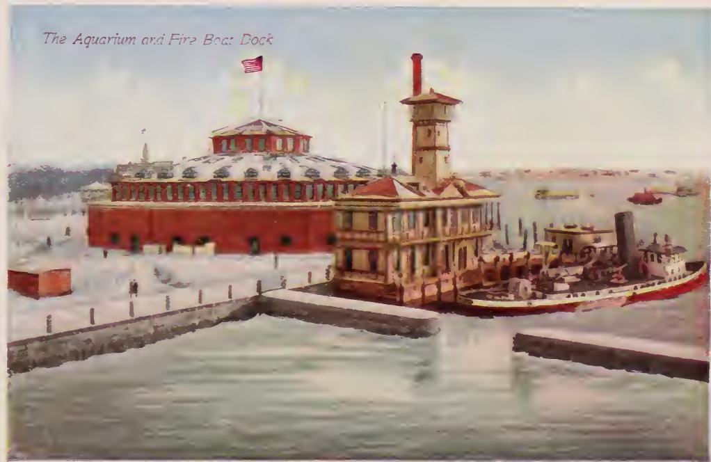
The Aquarium and Fire Boat Dock

Aquarium and Fire Boat Dock. The Aquarium was an old fort, built in 1807, and later used as an immigrant depot. Today it contains a wonderful collection of all kinds of living fish. In front are the fire boat headquarters. Fireboats like those shown in the picture are the only practical means of fighting fires where there is such a long waterfront and such heavy shipping.