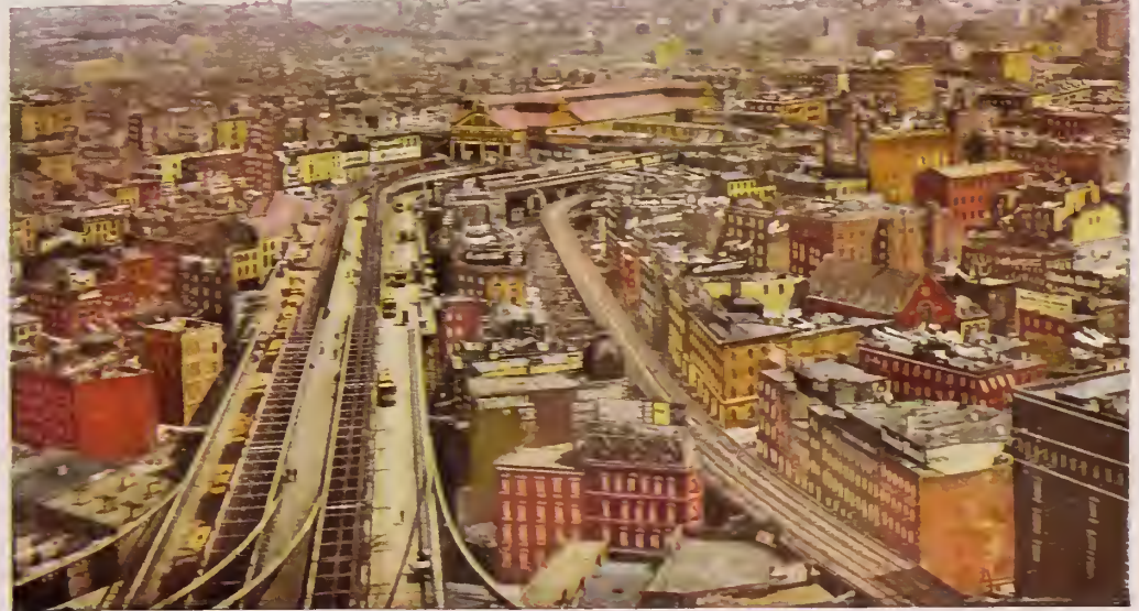
Brooklyn Bridge, New York, Brooklyn Approach

Brooklyn Bridge, showing the Brooklyn Approach to the Bridge. At the end of the bridge is the depot of the bridge trains, which connect there with the Brooklyn elevated railways. The picture also shows a birdseye view of the manufacturing section of Brooklyn.