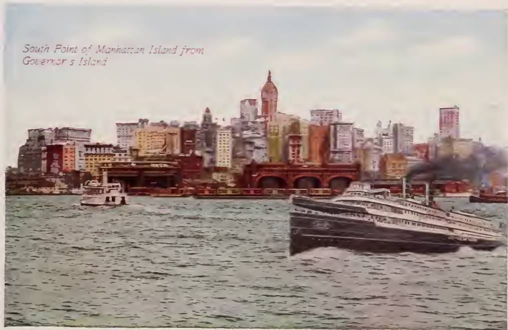
South Point of Manhattan Island from Governor's Island

The Battery, or south end of Manhattan Island. This picture shows New York City as the passengers on incoming steamers first see it. It shows how the city looks from the harbor. The high, red building in the center of the downtown skyscrapers is the Singer Building. The low arched building on the waterfront is the New York Terminal of the Municipal Ferry, running between Manhattan and Staten Island, across the bay.