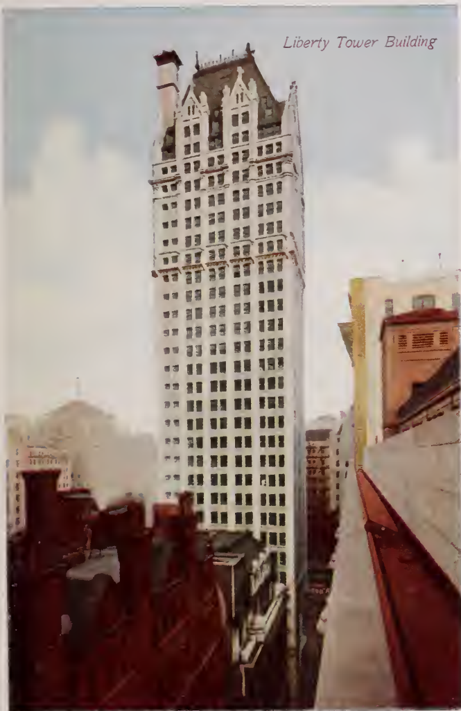
Liberty Tower Building

Liberty Tower Building is the most important structure on the Water Front, has twenty-four stories and is 324 feet high, is built of steel, granite and terra cotta, heated to 2,000 degrees, and is ornamented with architectural terra cotta and copper. Cost $4,000,000. It is absolutely fire-proof.