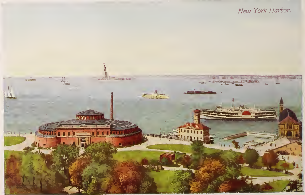
New York Harbor.

New York Harbor, showing aquarium, which has the finest collection of living fish ever displayed, Fire Boat Dock, Battery Park, Ellis Island and the Statue of Liberty in the distance.