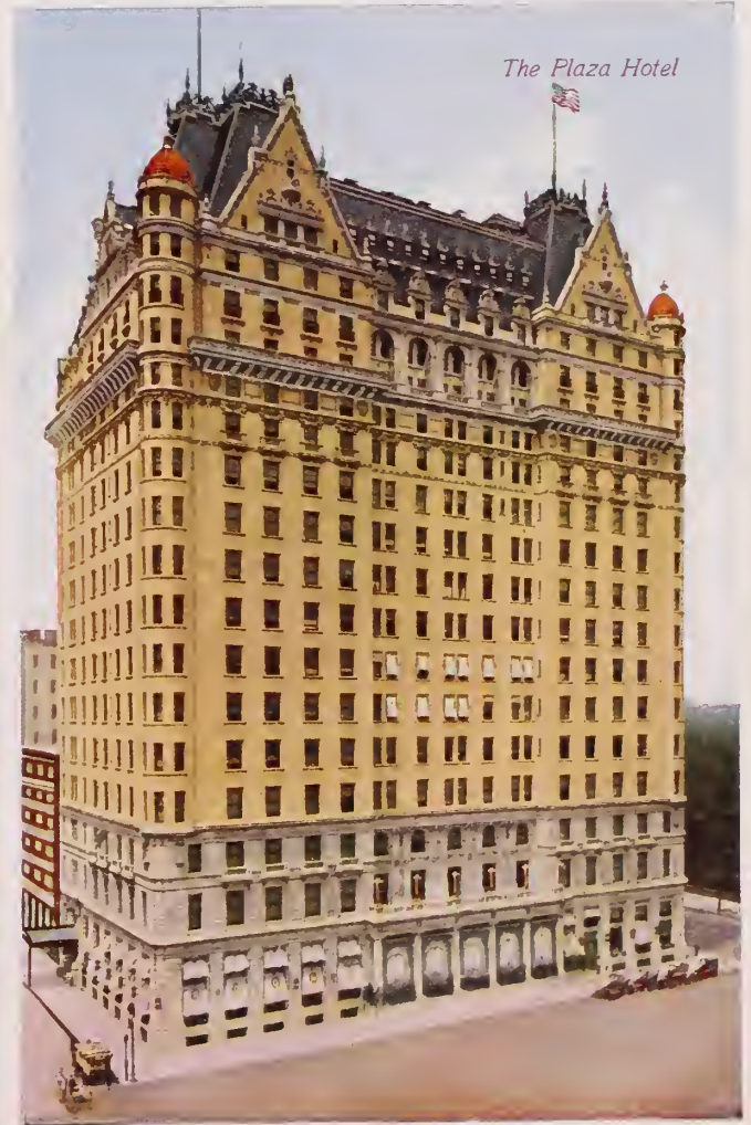
The Plaza Hotel

The Plaza Hotel, on 5th Avenue and 59th Street is in the center of the most fashionable district of New York. It is a beautiful and elegant skyscraper hotel, overlooking Central Park. It is twenty stories high, luxuriously appointed, and cost $8,000,000.