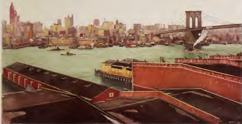
Lower Manhattan from Brooklyn

View of New York from Brooklyn. Showing the Manhattan skyline and the busiest waterfront in the world. On the extreme left of the picture is the Singer Building, towering above all others. On the right is the New York end of the Brooklyn Bridge.