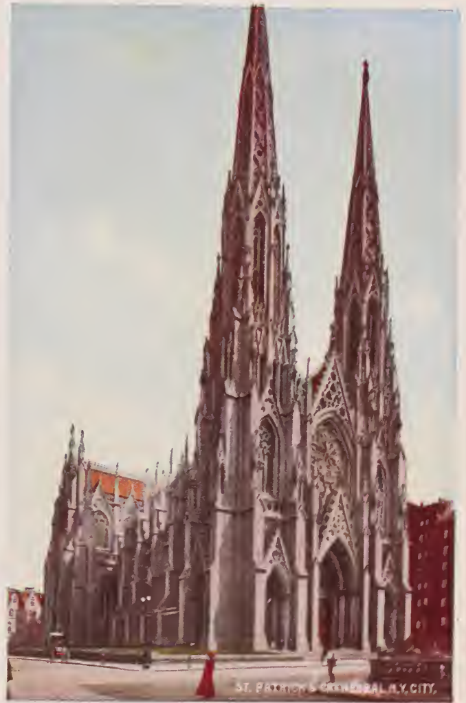
ST. PATRICK'S CATHEDRAL, N.Y. CITY.