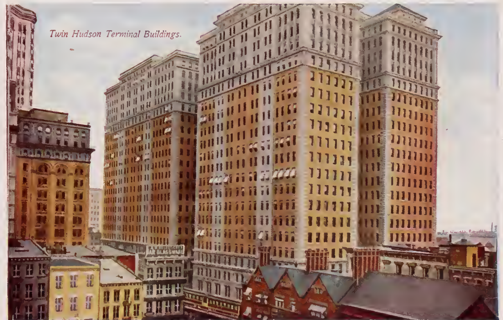
Twin Hudson Terminal Buildings.

Herald Square, Broadway and 6th Avenue, 34th to 35th Streets, received its name from the Herald Building, the low building shown near the center of the picture. This is the busiest square in the city, being the center of the shopping, theatre and fashionable hotel districts. The street where the cars are is Broadway, further up can be seen the Times Building.