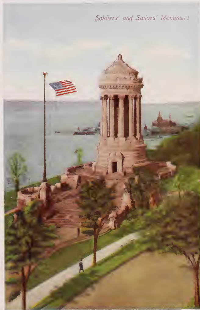
Soldiers' and Sailors' Monument

Riverside Drive and Soldiers' and Sailors' Monument. Soldiers' and Sailors' Monument is situated near Riverside Drive and 89th St. Was erected in 1902 to honor the Union Soldiers. Made of white marble, is 100 feet high and has a granite base. Riverside Drive is from 90 to 168 feet wide, and is one of the most select residential districts in the City of New York.